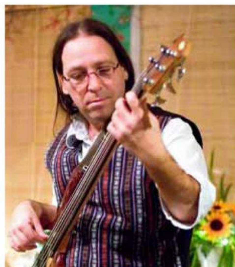
Bassist Shimon Ben-Shir